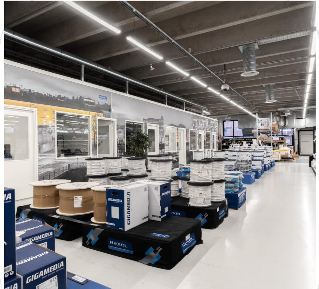
Huge customizable open plan