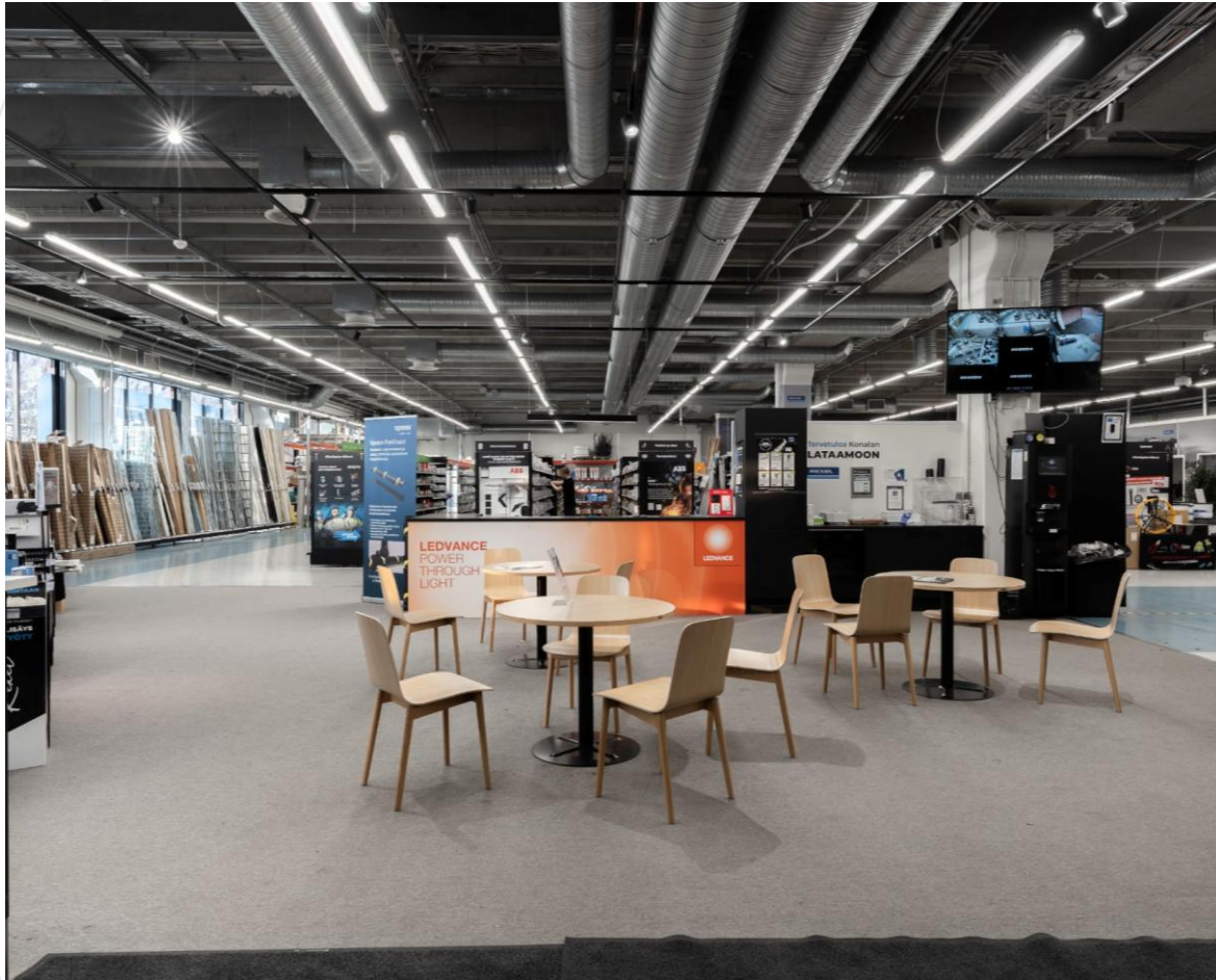
Bright sales floor and modern lighting