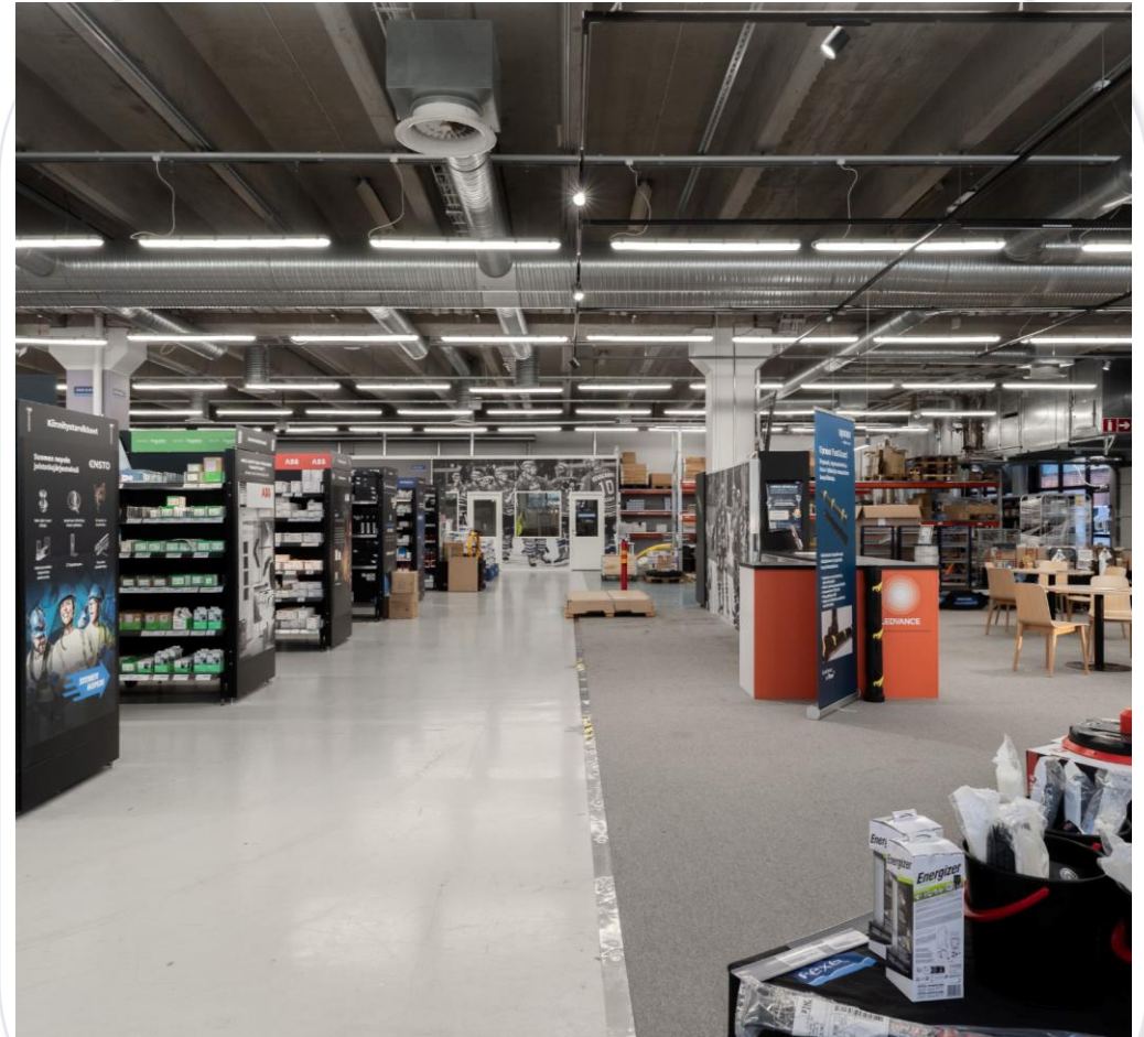
Space to support daily logistics