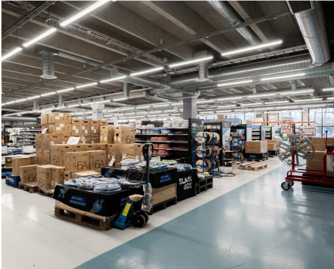
Full wall large windows towards Vihdintie